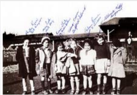
Speaking to Memory: Images and Voices from St. Michael's Residential School