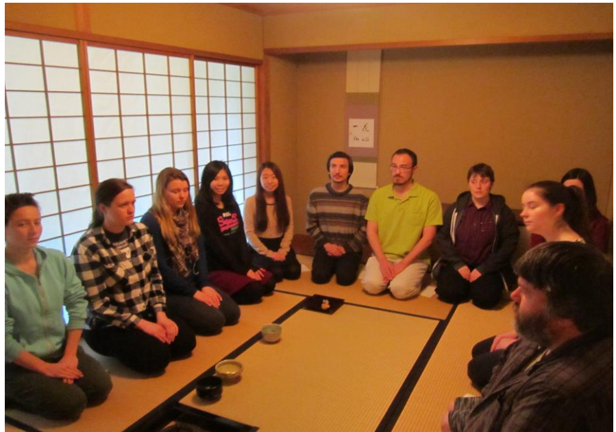
Students sit in seiza style on tatami (rice straw mats) while participating in a Japanese Tea Ceremony as part of the course