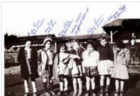
Speaking to Memory: Images and Voices from St. Michael's Residential School