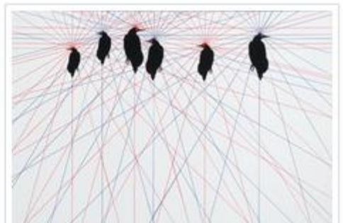
The Marvellous Real: Art from Mexico, 1926 - 2011